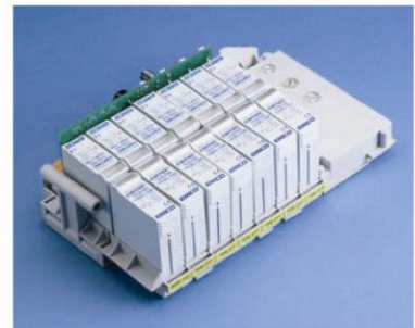
TDX Replaceable Module backplane fully removed.