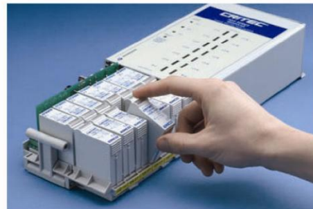
TDX Replaceable Modules.

The NEMA®-4 weather-tight housing allows the TDX to be installed on indoor or outdoor service panels. The preconfigured connecting leads simplify installation. The unique narrow construction allows the SPD to fit between adjacent panel boards and connect via a 90-degree elbow. A flush mounting kit is also available for installing the SPD in drywall applications.